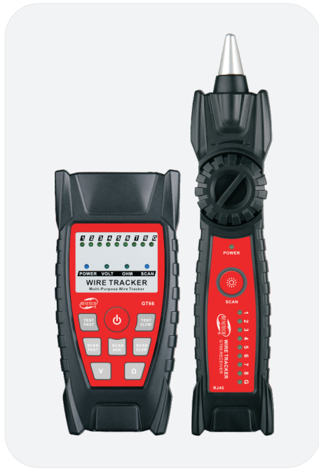
Standard:Q/GMY 020-2015 Version:GT66-EN-01

existence and positive or negative characteristic of the voltage. This function only requires the transmitter. Press the V button; get into the cable voltage test mode, VOLT light turns on. Plug the alligator clip into the RJ11 socket of the transmitter, and clip the Red & Black clip to the measuring wiring, or plug the RJ11 telephone line directly into the RJ11 interface. The OHM or SCAN light would light, if there is a phone line voltage. When the SCAN light lights, the red alligator clip connects the anode, on the other hand, it is cathode, when the OHM light lights. This product is designed for weak current, such as phone line, do NOT use for strong current, in case of electric shock and damage of the equipment.